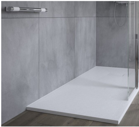
AKW Onyx Low Level Shower Tray