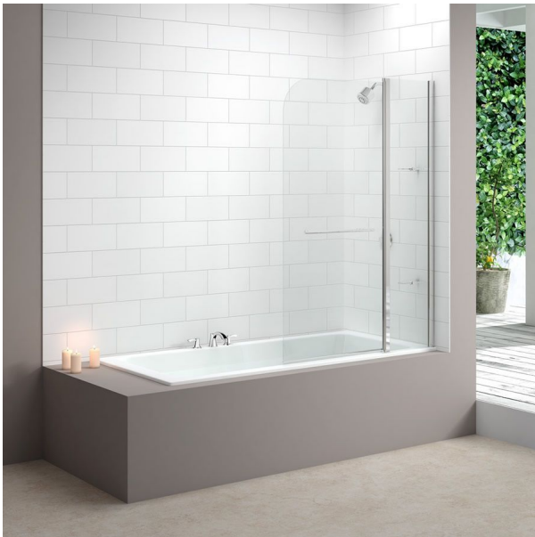
Merlyn 6mm 2 Panel Curved Bath Screen with Towel Rail & Shelves - MB3