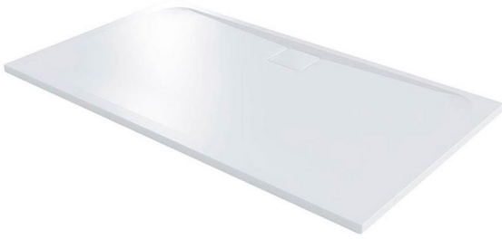
Merlyn Level25 Wet Room Shower Tray & Drain - Rectangular