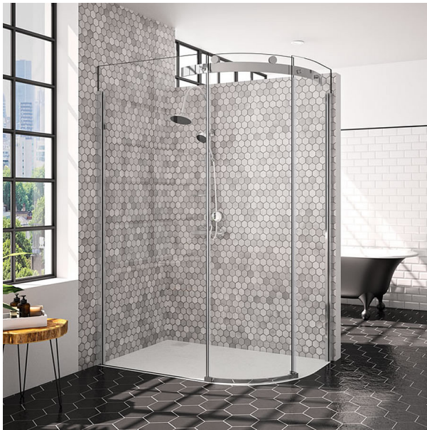
Merlyn Series 10 1 Door Offset Quadrant Shower Enclosure