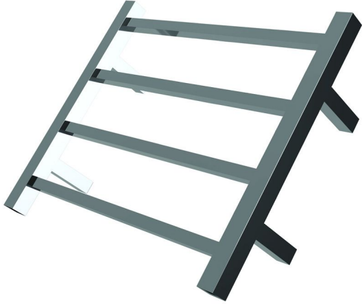
Warmup Bathroom Collection Electric Wall Heating Towel Rail - 4 Bars - Square