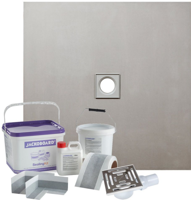
Wet Room Kit - Centre Drain