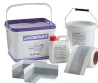
Optional Tanking, Fixing & Sealing Kit