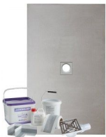
1800 x 900 x 25mm - Centre