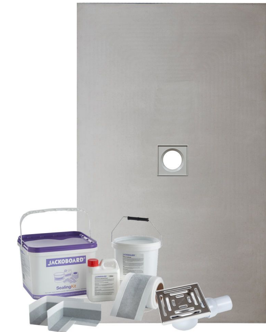
Wet Room Kit - Centre Drain