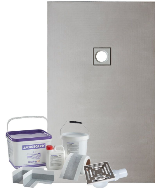
Wet Room Kit - Offset Drain